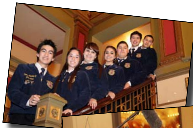
Above: Members of the San Diego FFA chapter attended the red carpet premiere.

Scholarships from the Richard Wallrath Educational Foundation, established in 2006, are awarded to deserving FFA members across the state to help further their education. Today, 35 $10,000 scholarships are given to Texas FFA members who excel academically, participate in FFA and have the desire to further their education.