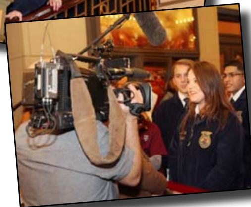
Right: FFA members were interviewed by Austin news stations.